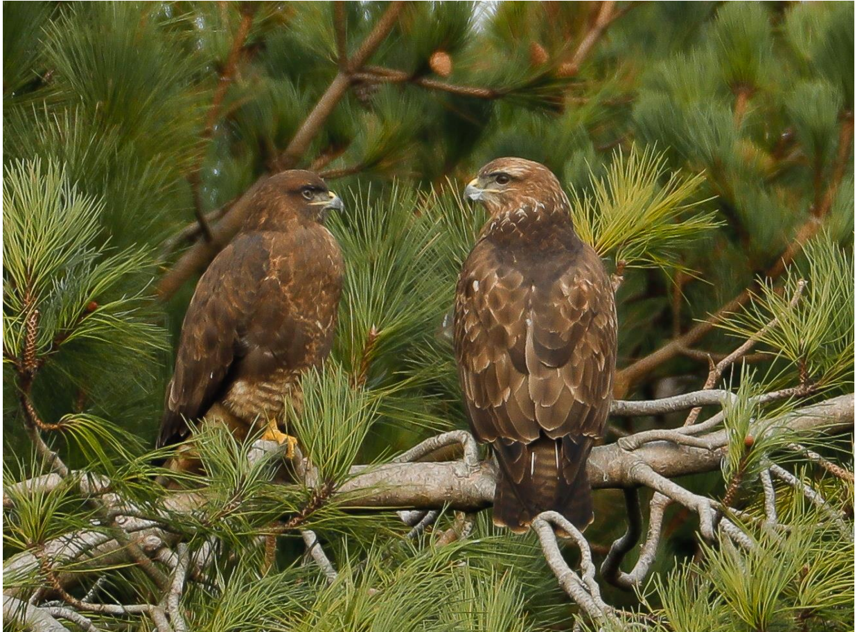
Common Buzzards.