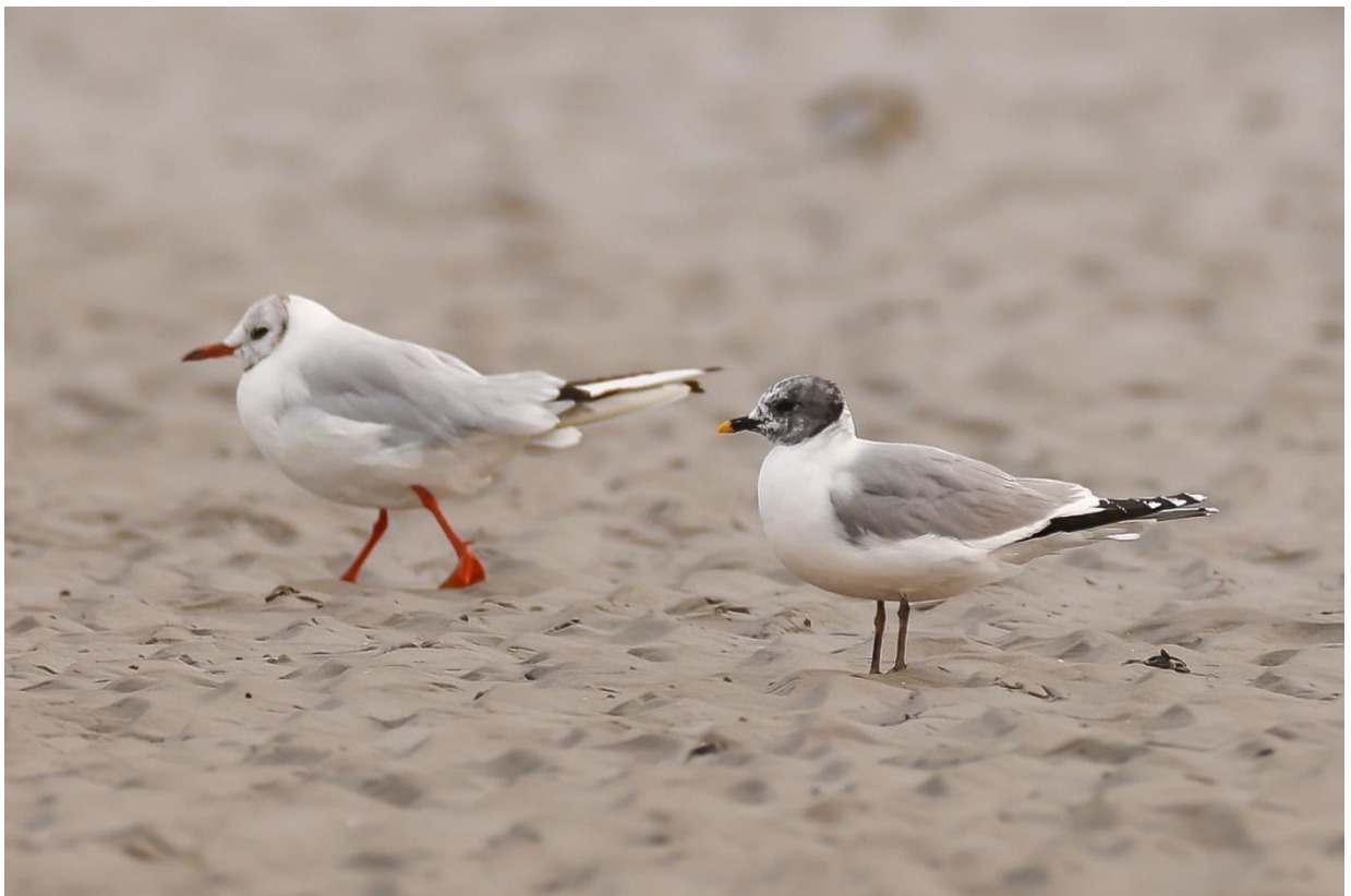
Sabine's Gull