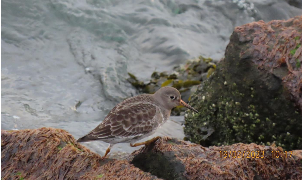
Purple Sandpiper

Very small numbers reported in Dublin Bay in the winter of 2022/2023 so it's not surprising that only one bird was recorded at North Bull Island.