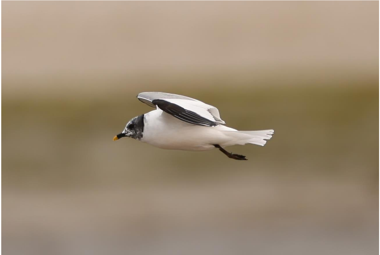
Sabine's Gull