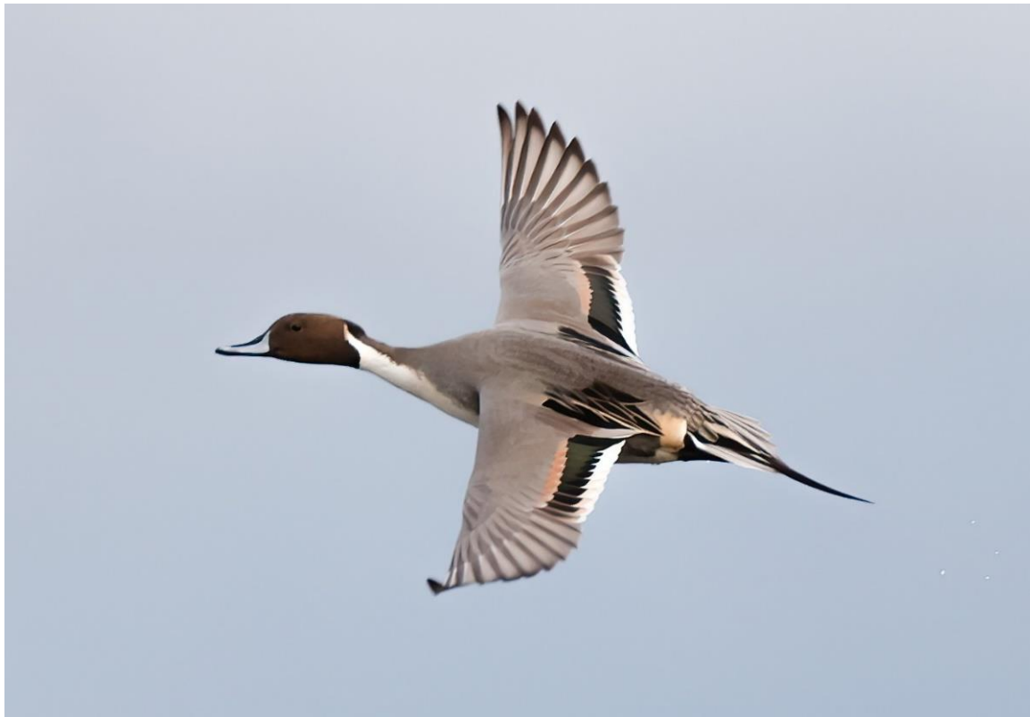
Pintail