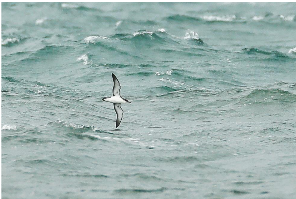
Manx Shearwater