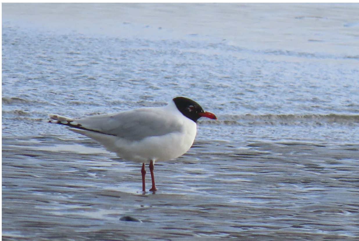
Mediterranean Gull