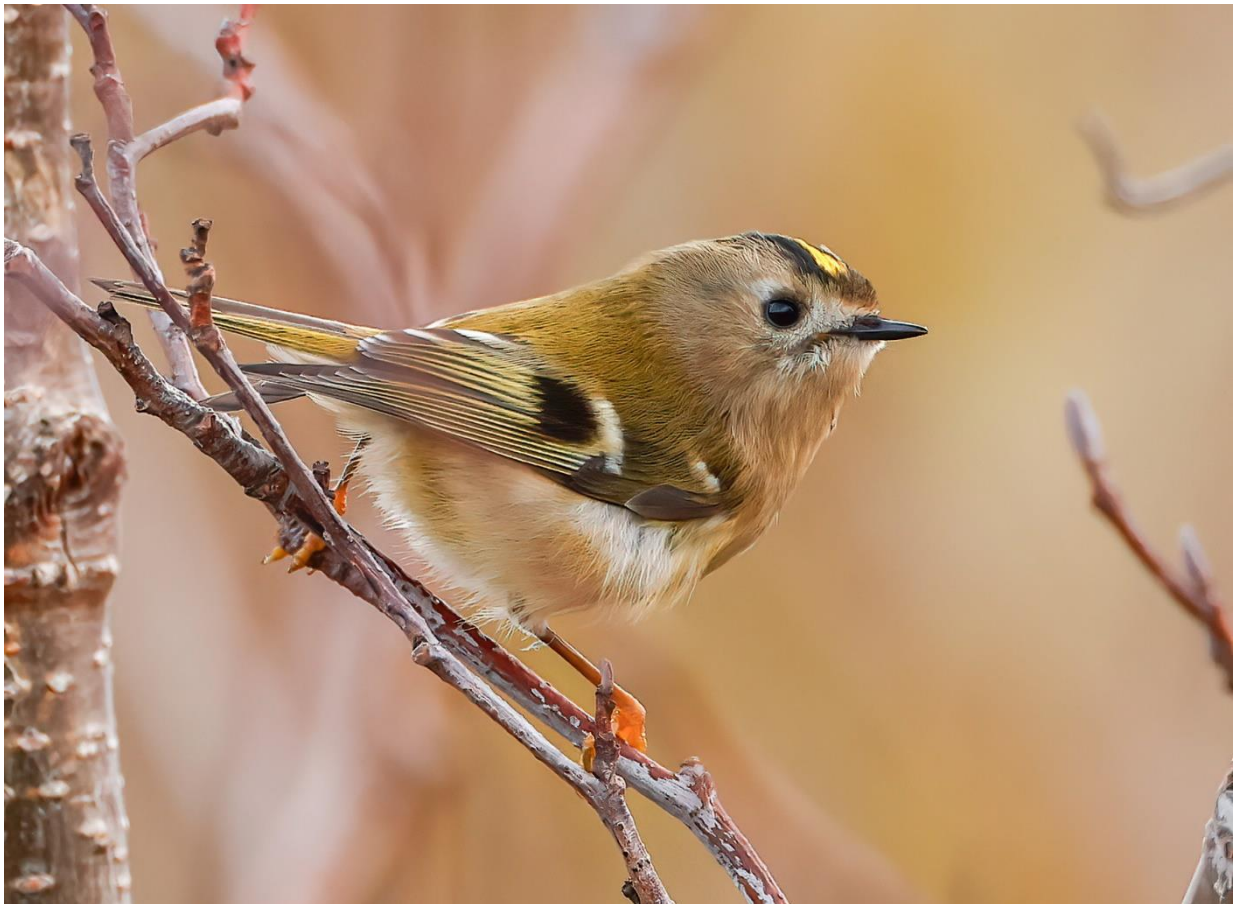
Goldcrest