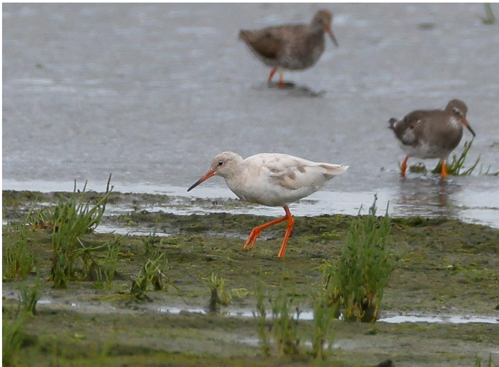
Redshank