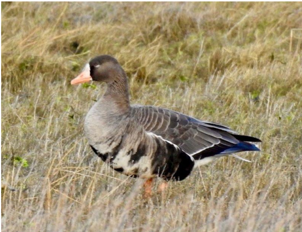
White-fronted Goose.

This bird belongs to the Greenland race flavirostris and is the first record since 2014.