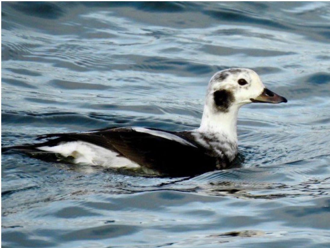
Long-tailed Duck

As usual, small numbers were reported offshore but the records in May, June and July were unseasonal and noteworthy.