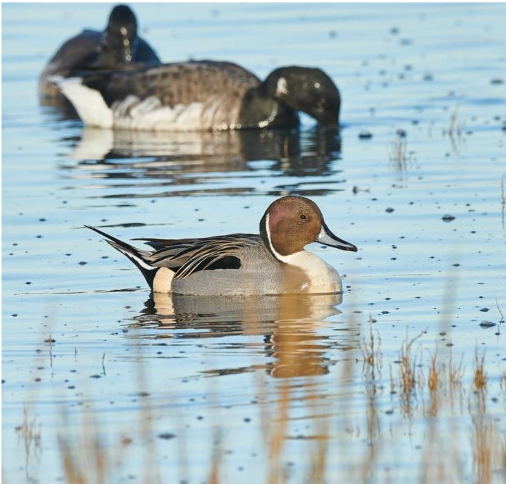
Pintail (Photo: Seán A O’Laoire)