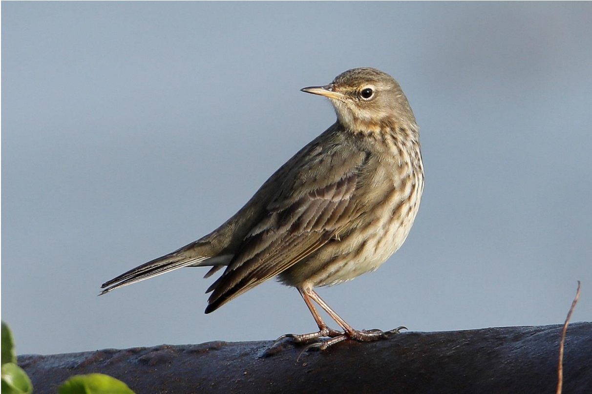
Rock Pipit