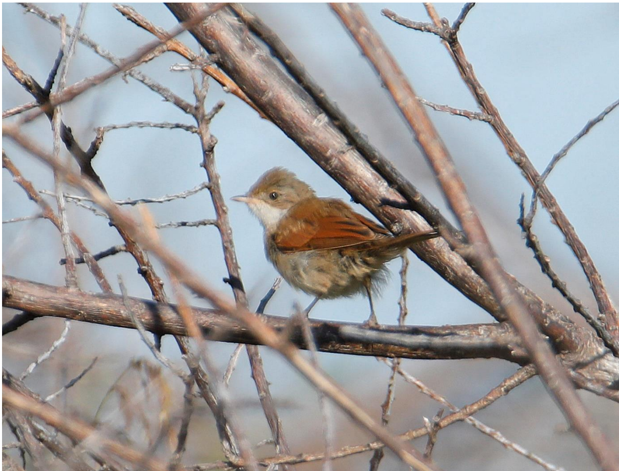
Common Whitethroat

Very scarce passage migrant One on 30th August and three on 8th September.