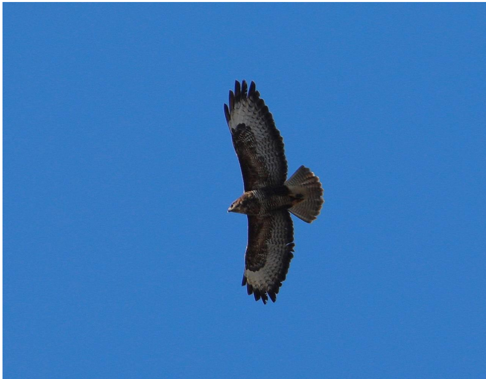
Common Buzzard