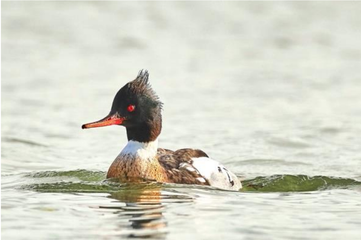
Red-breasted Merganser