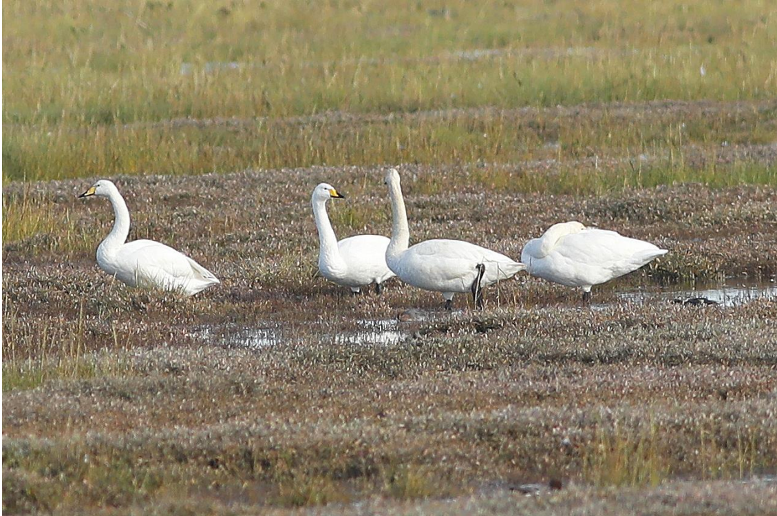
Whooper Swans