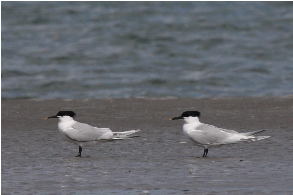
Sandwich Terns

Highest counts: 33 on 7th April (Jim Duffy) and 57 on 2nd August (Ciaran Dunne).