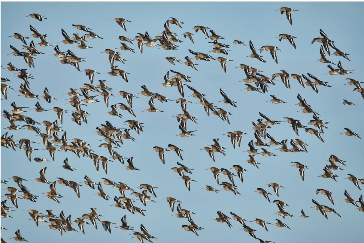
Black-tailed Godwits