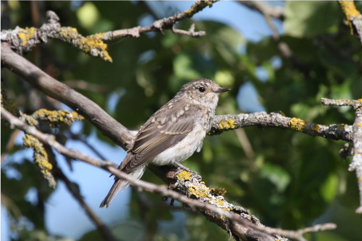
Spotted Flycatcher.