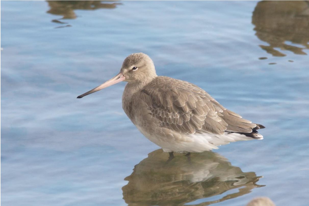
Black-tailed Godwit