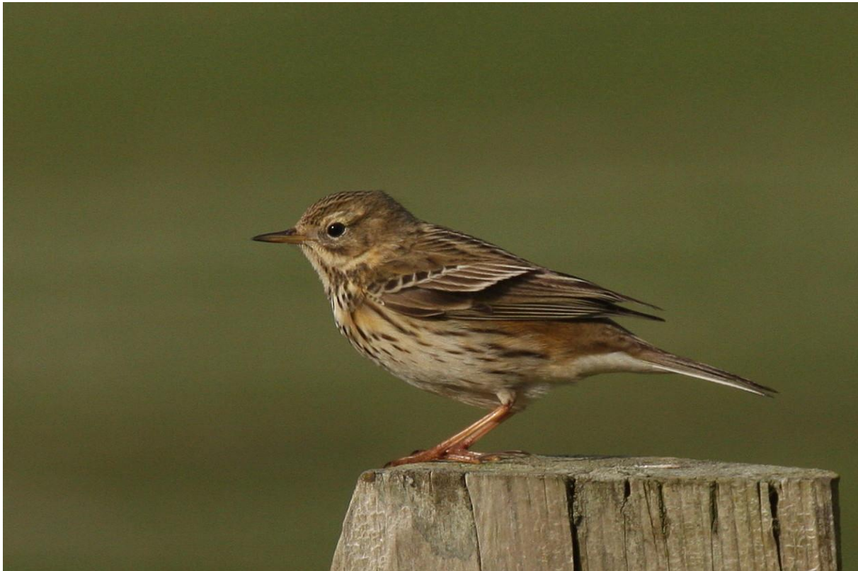
Meadow Pipit