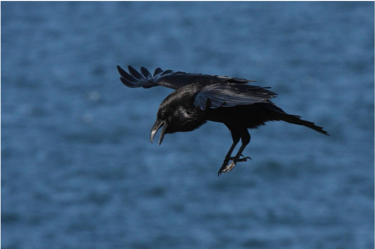
Raven