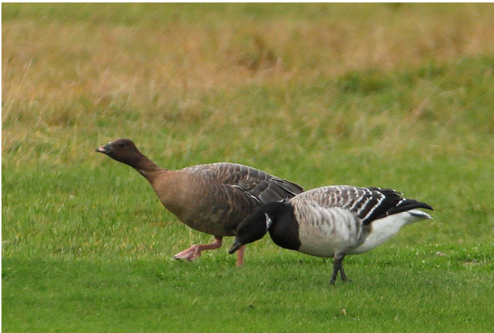
Pink-footed Goose with Brent Goose

This species has occurred in three of the last four winters.