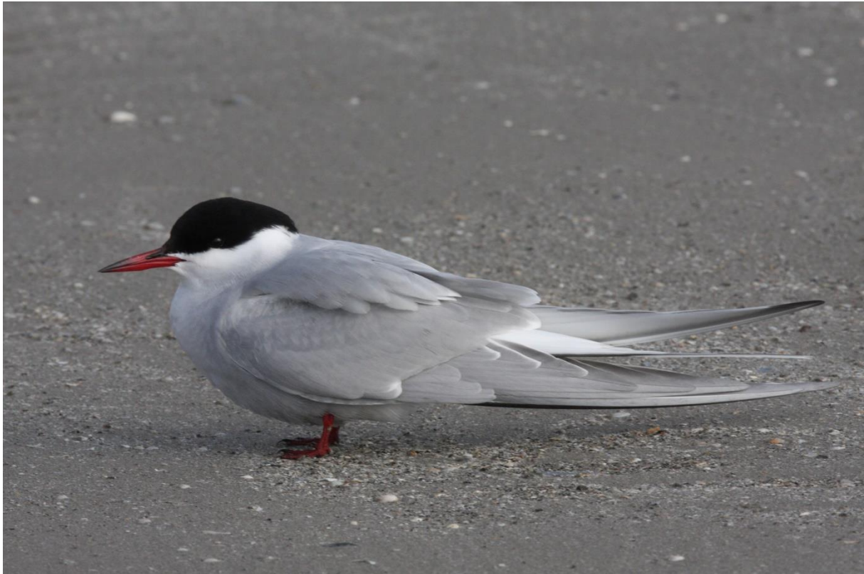
Common Tern

Up to 15 regularly from April to late June (many observers).