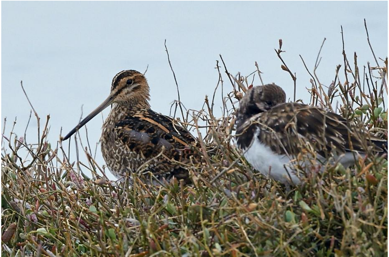
Common Snipe