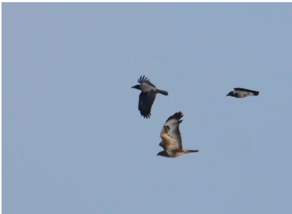
Common Buzzard

The November bird is probably the first of this species to be photographed at this site.