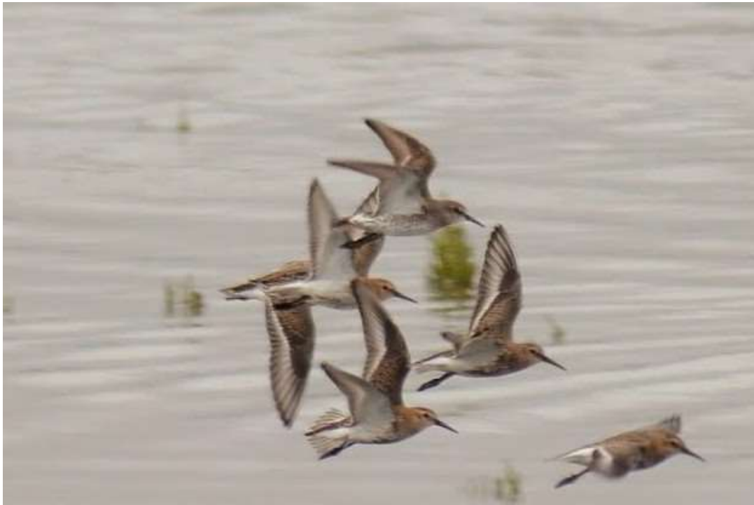
White-rumped Sandpiper – topmost bird