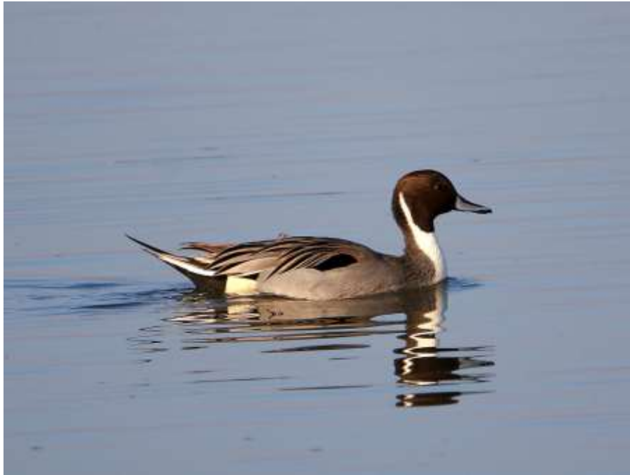
Pintail