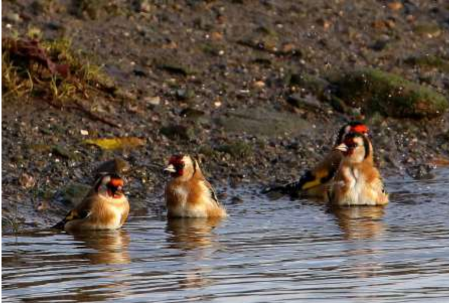
Goldfinches