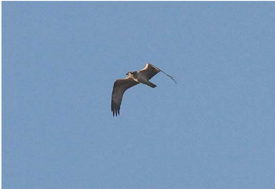
Osprey (Aidan G. Kelly)

One flew over the northern lagoon on 13th September (Aidan G. Kelly).