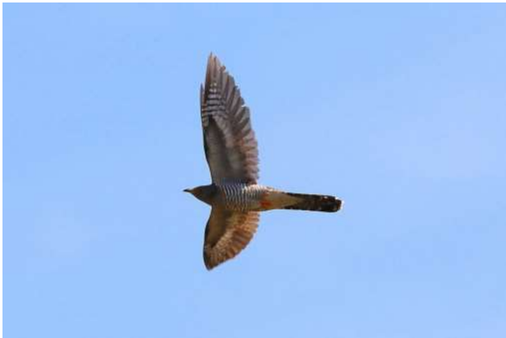
Cuckoo