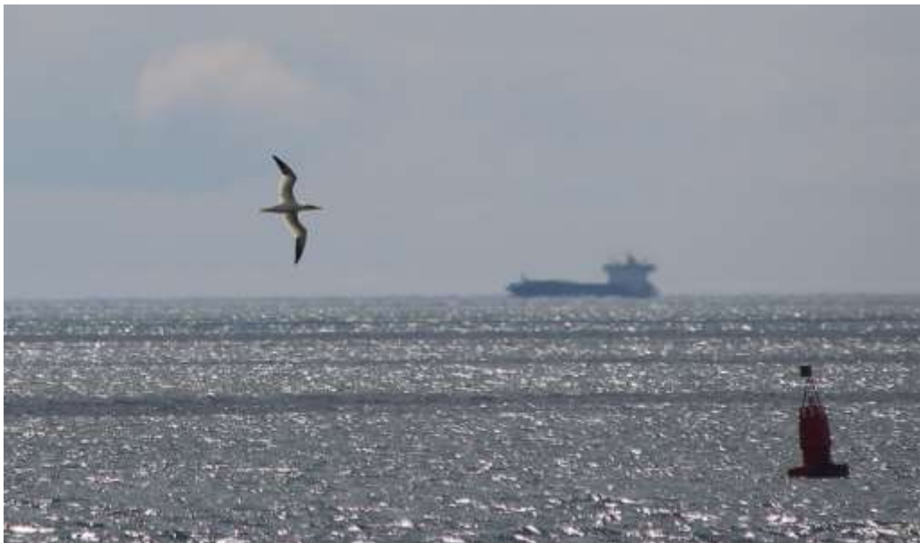
Gannet off the beach