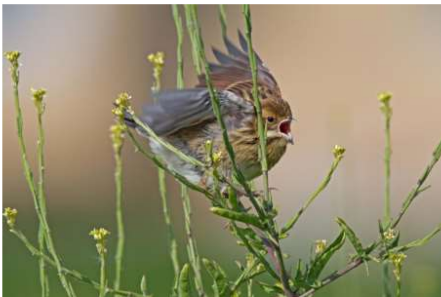
Reed Bunting juvenile (Dave MacPherson)