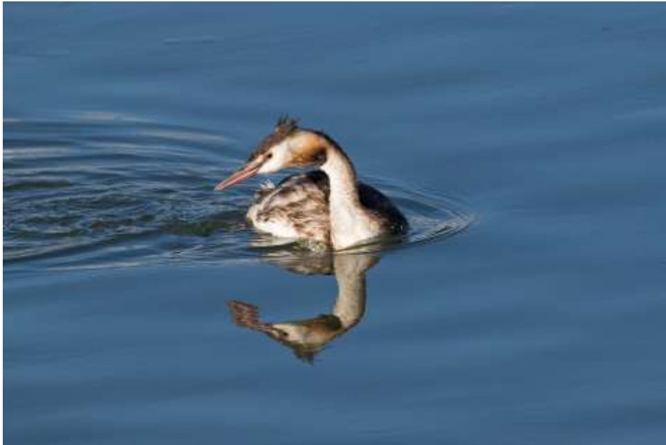
Great Crested Grebe (Dave MacPherson)