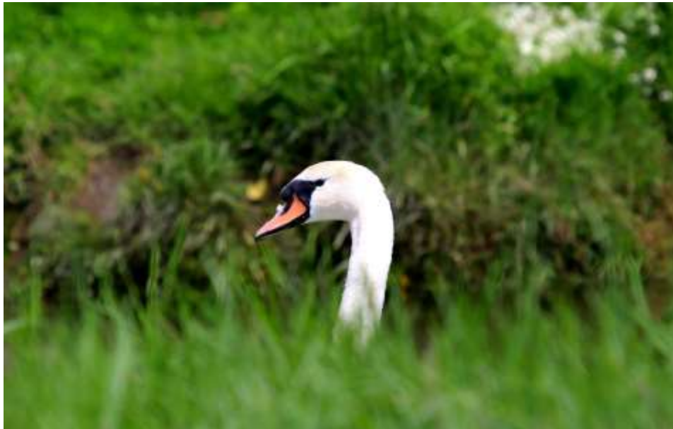
Mute Swan