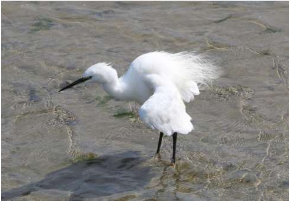
Little Egret