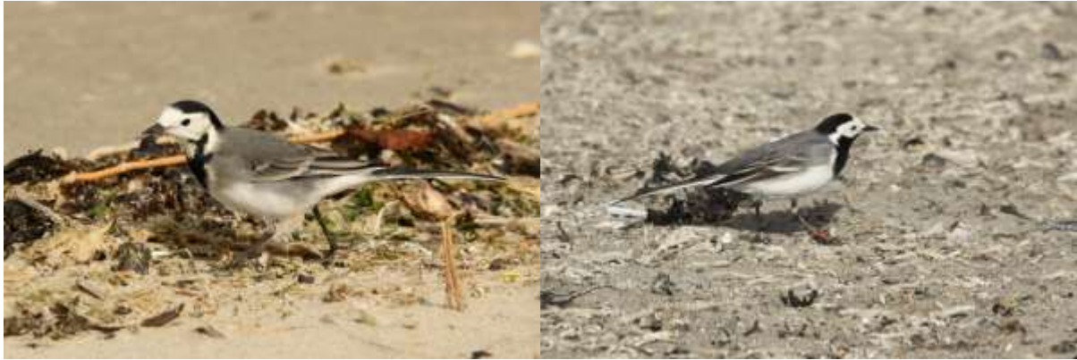
White Wagtails