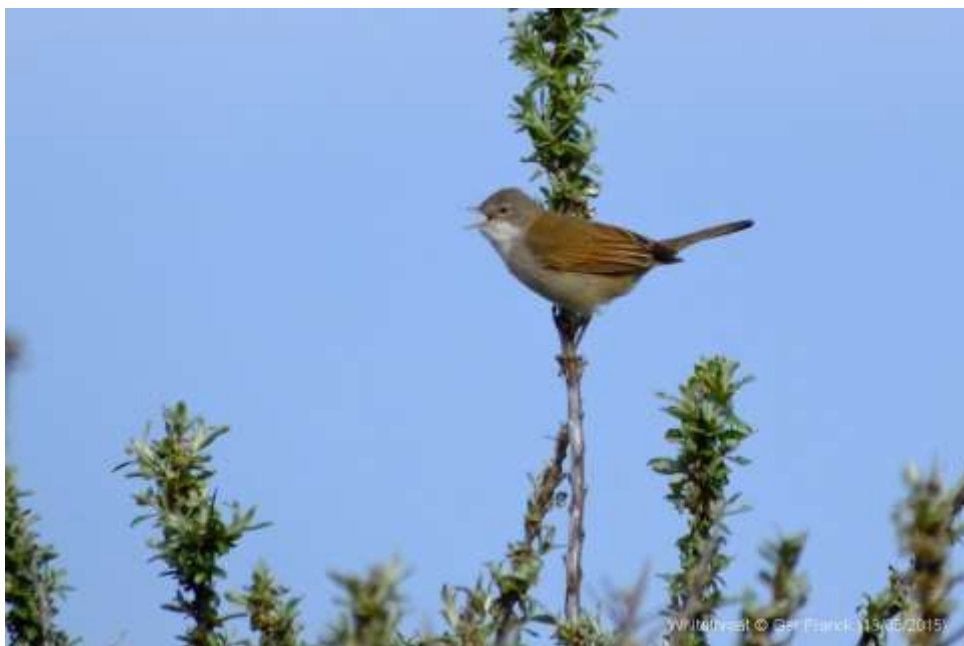
Common Whitethroat (Ger Franck)

Autumn passage: Two on 26th August and one on 12th September in the Alder Marsh (Tom Cooney).