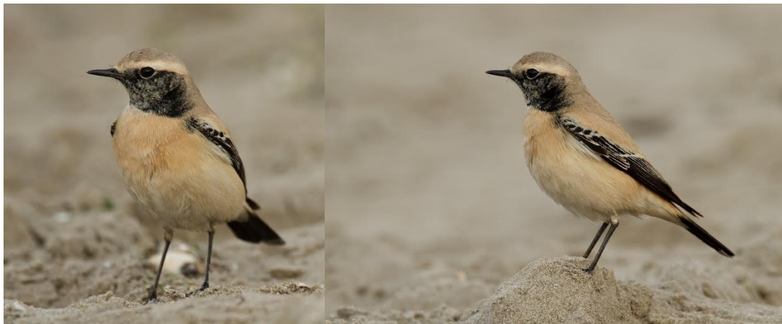
Desert Wheatear

This is the first record for County Dublin and the 6 th for Ireland.