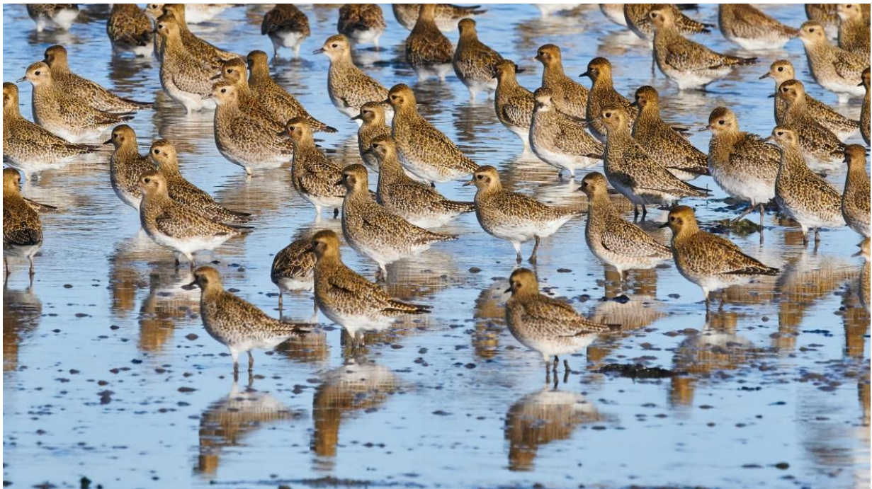
Golden Plovers.