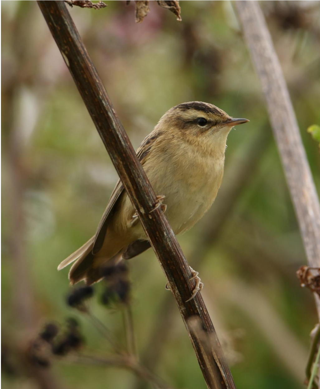
Sedge Warbler.