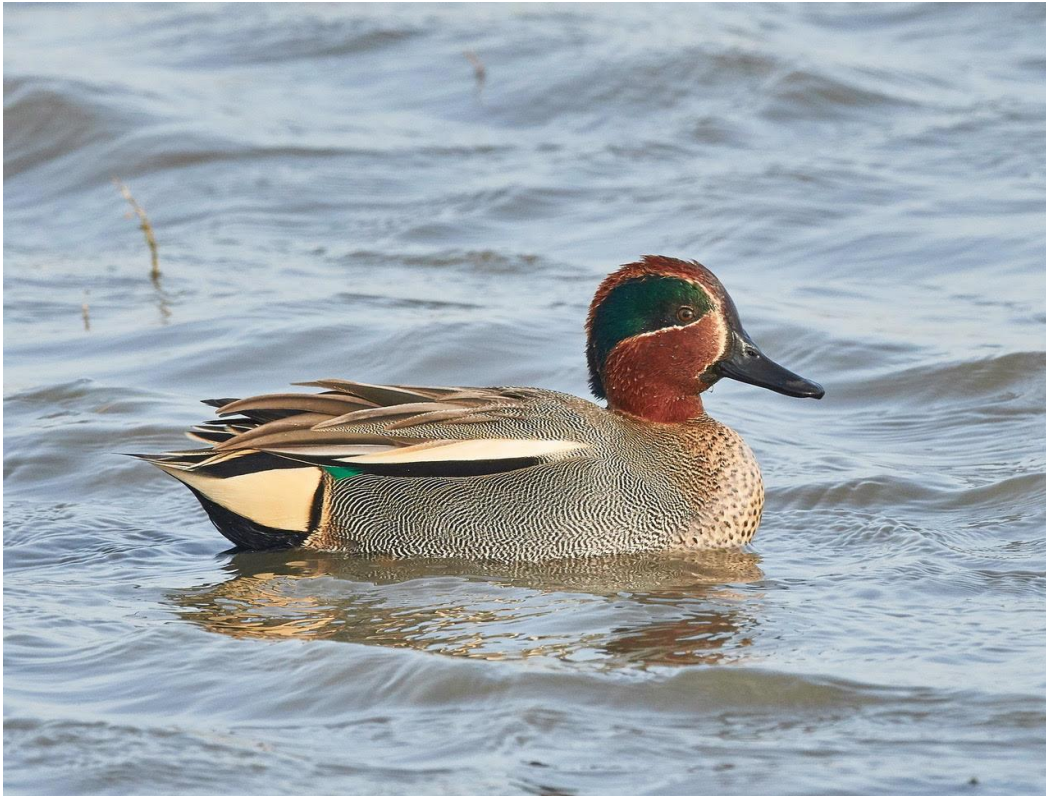
Male Teal (Photo: Sean O'Laoire).

Records at coastal sites in summer are quite scarce.