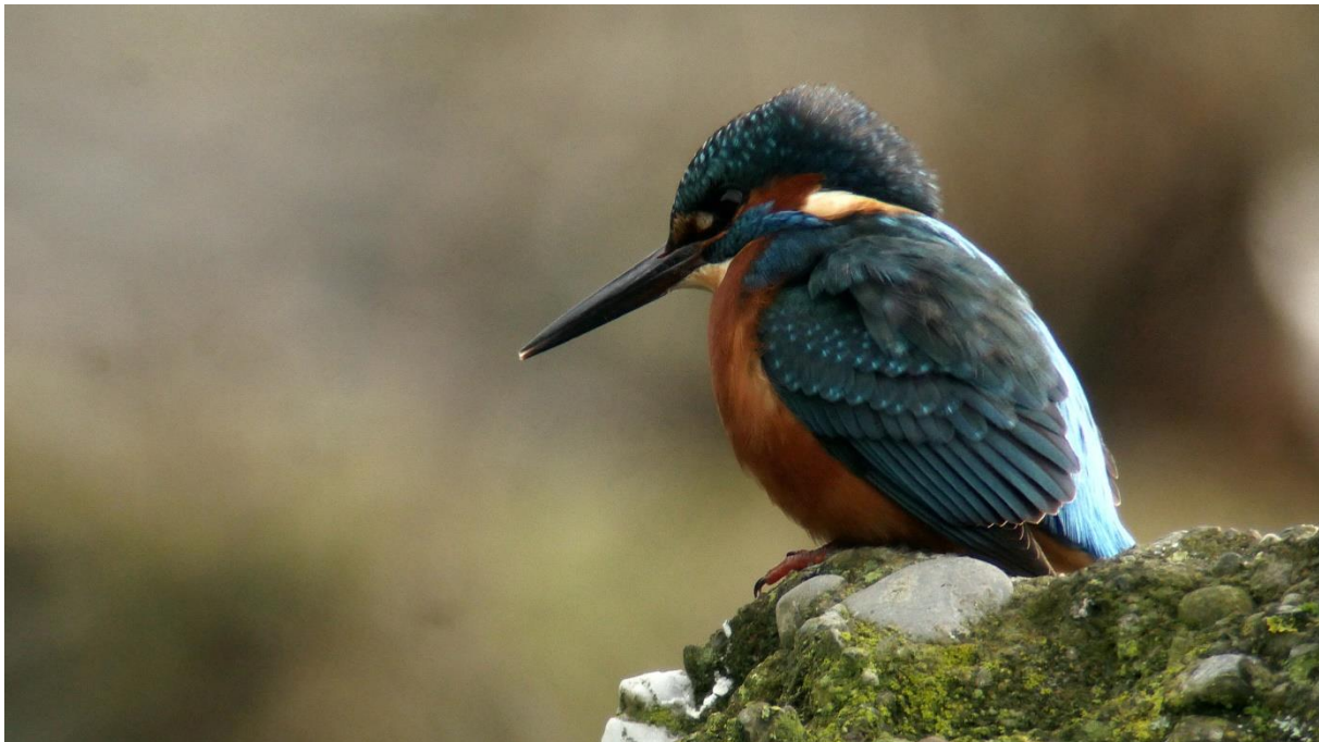
Kingfisher

One was reported from 8th January to 9th March and from 11th August to the end of the year (many observers). The majority of reports were from the River Santry outflow.