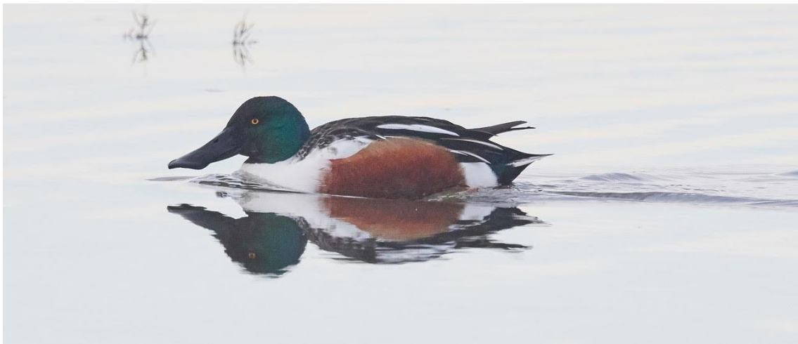
Shoveler.