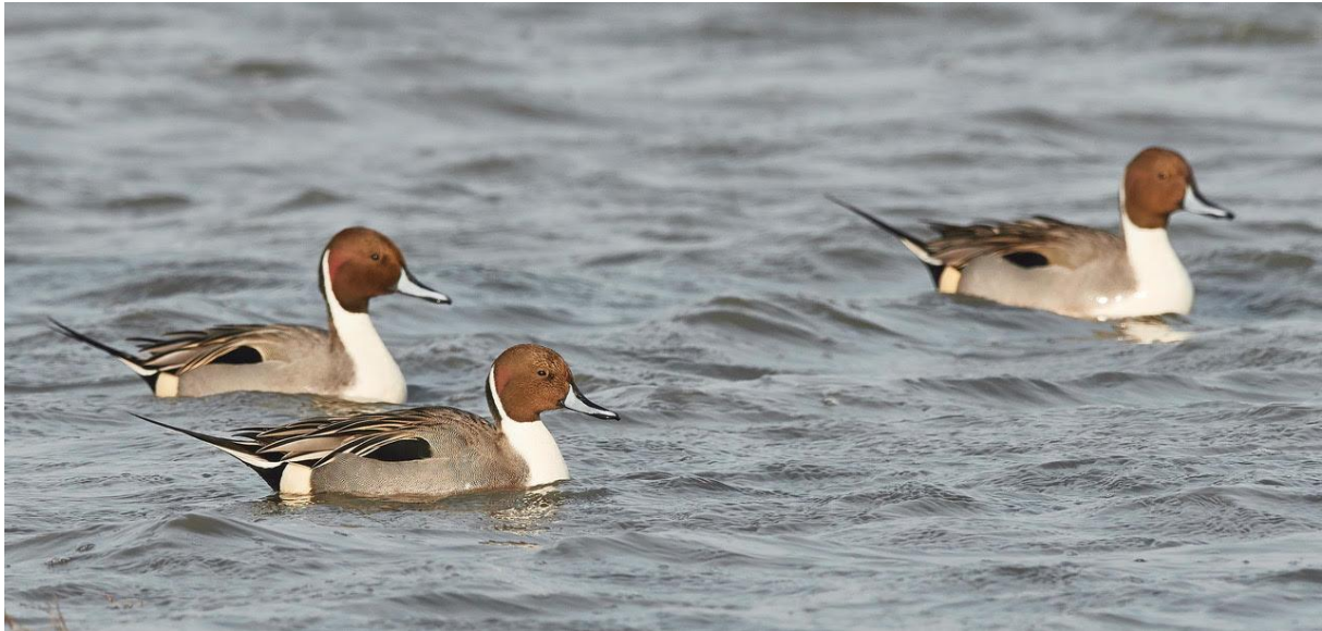
Pintails (Photo: Sean O'Laoire).

Although the North Bull is still one of the most reliable sites in Ireland to see this species at close quarters, the wintering population has declined considerable in recent decades.