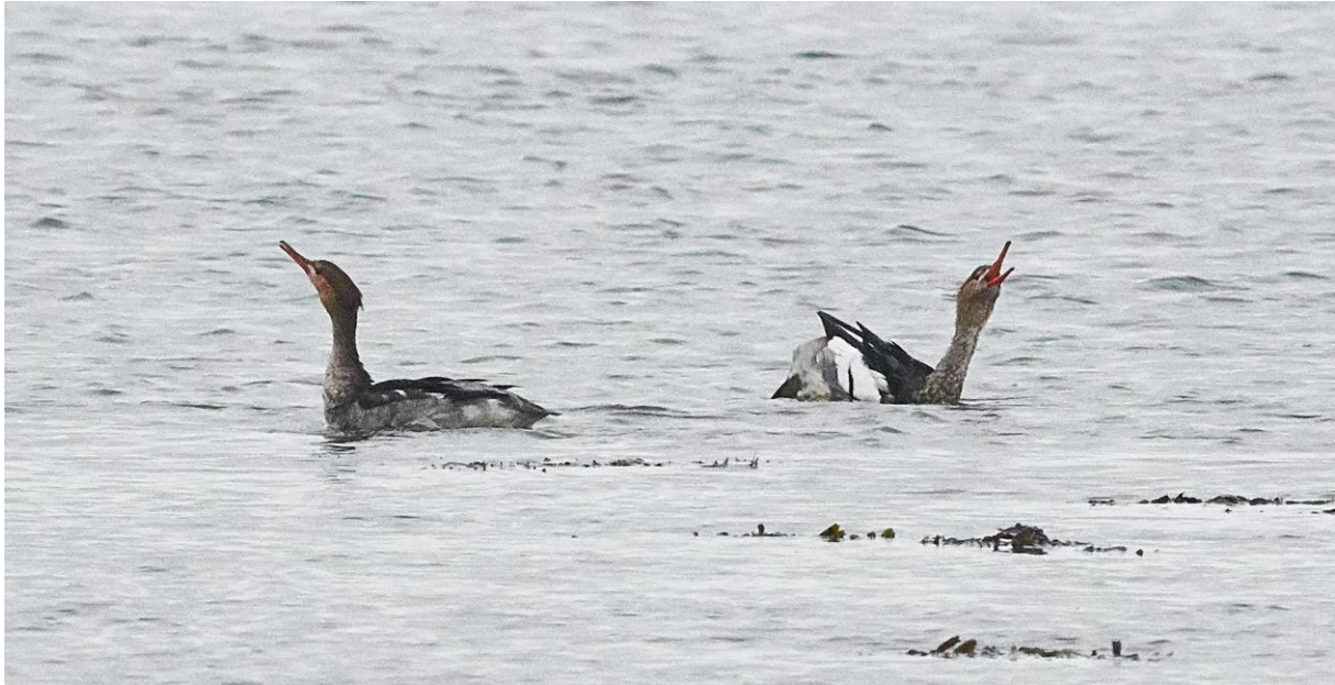
Red-breasted Mergansers.

Up to ten or more on most dates in Sutton Creek, north lagoon and off the Bull Wall.