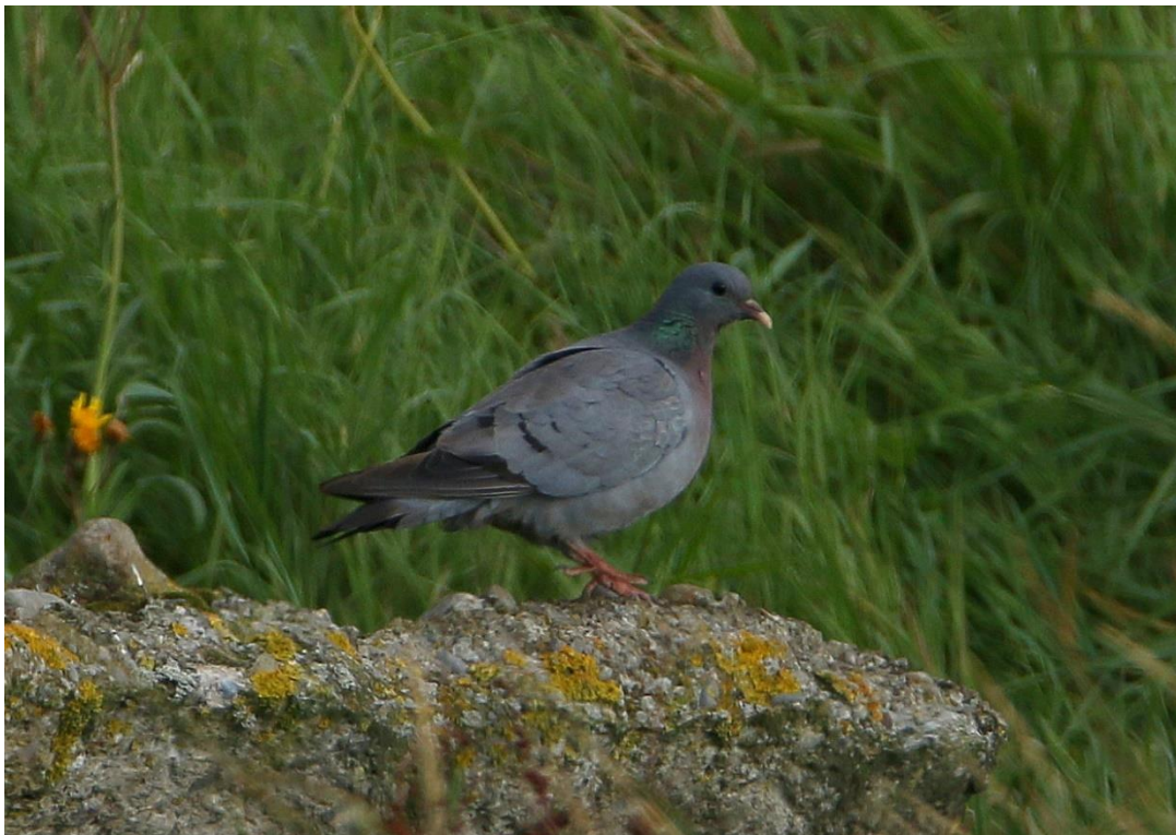
Stock Dove