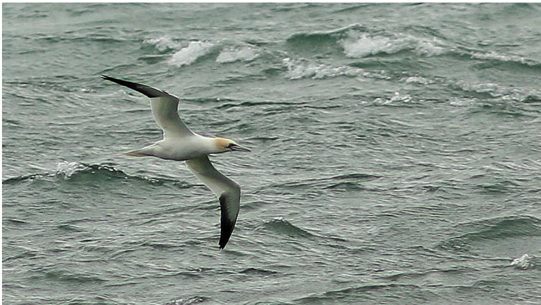
Gannet