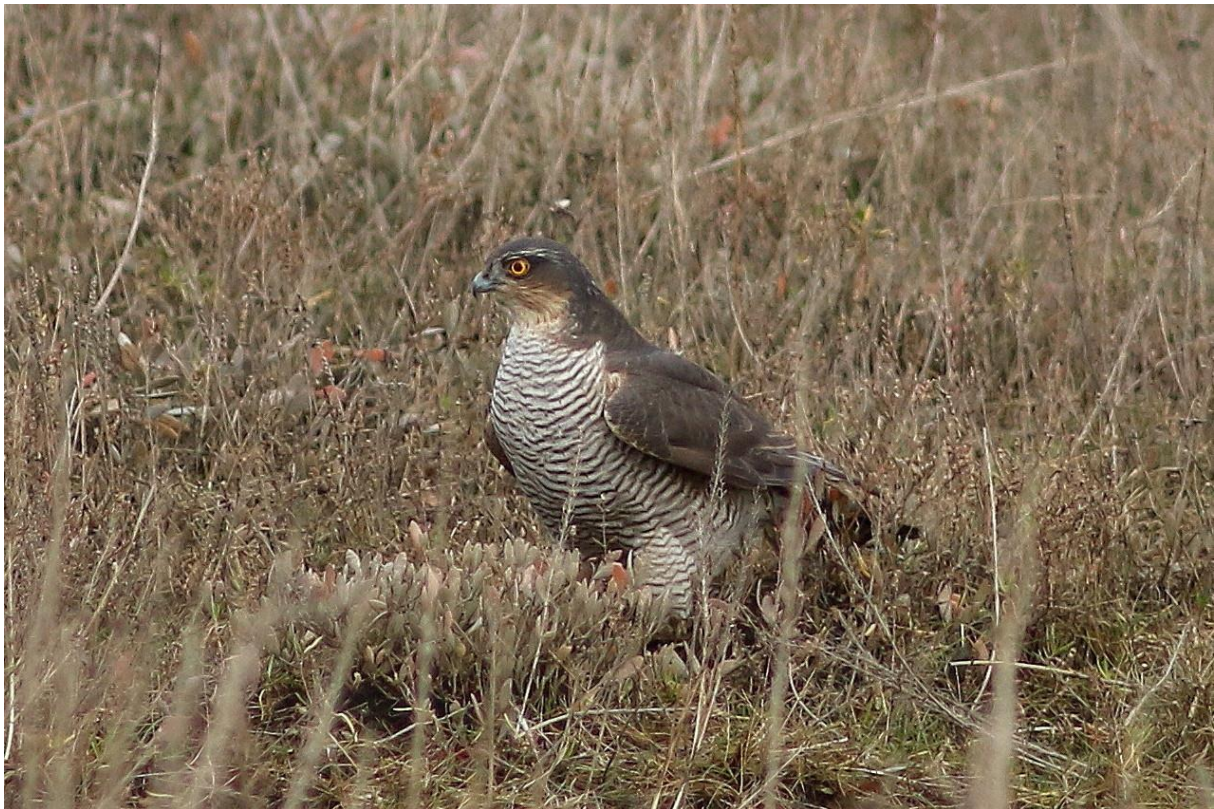
Sparrowhawk.

Many reports of single birds throughout the year with two on 21st December.