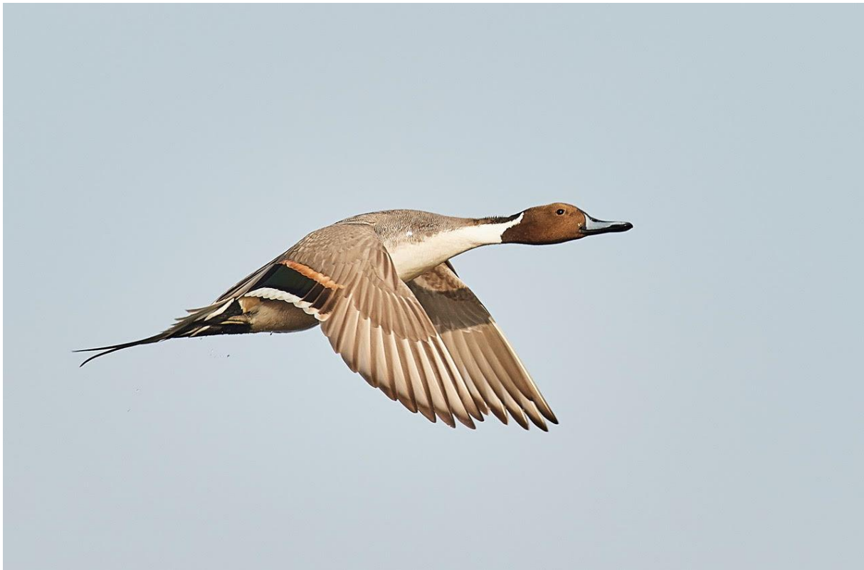
Male Pintail.