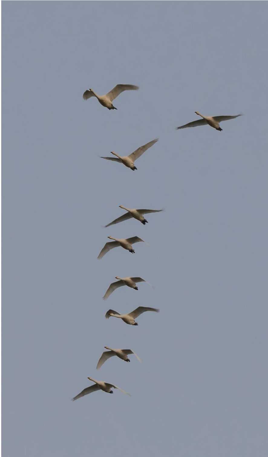
Whooper Swans.

January : Ten over the island on 20th (Hugh Delaney). March : Four over the island on 25th (Seán A O'Laoire) and probably a different group of four on the southern mudflats on 26th (Brian Gormley). Two passed over the island on 30th (Alan Dalton). October : five flew south over the island on 9th and four flew north on 31st (Tom Cooney). November : nine flew south over the Wooden Bridge on the 9th (John Fox).