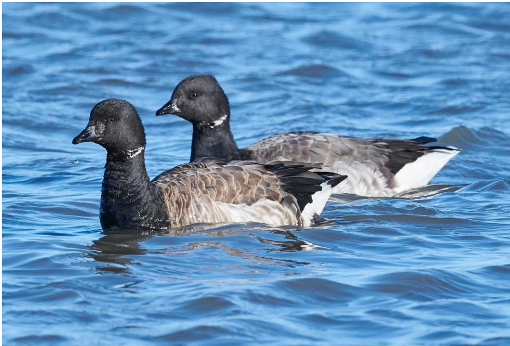
Brent Goose.

Autumn arrivals: One on 9th September (Tom Carroll).