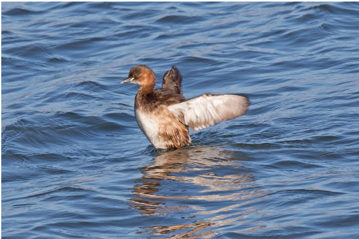
Little Grebe (Photo: Dave MacPherson).

At high tide, up to five regularly at the Wooden Bridge or in channels in the southern saltmarsh outside the breeding season. Up to ten regularly during November and December (Mark Carmody et al. ).