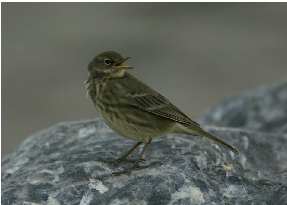
Rock Pipit