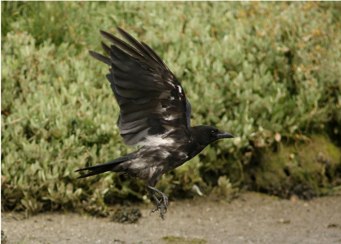
Hybrid Carrion x Hooded Crow

One present from 2016 was reported throughout 2017.