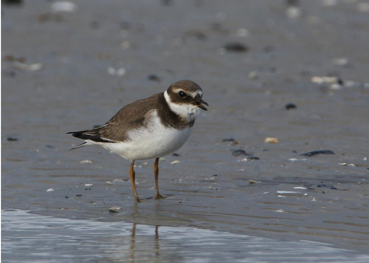
Ringed Plovers

Small numbers reported except in mid-summer. A minimum of 241 on 22nd August feeding on the north saltmarsh at high tide was unusual.