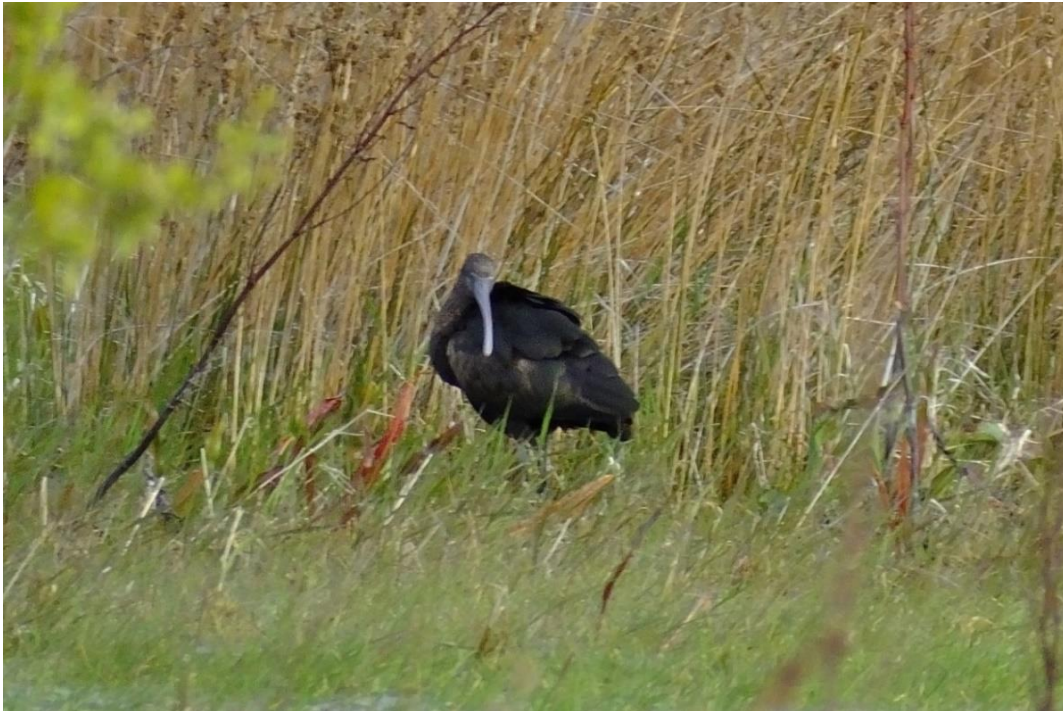
Glossy Ibis

This is the first site record for 72 years.