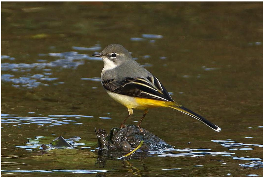
Grey Wagtail (Mark Collins)

Single birds reported on 5th August at River Santry outflow (Tom Carroll), at Blackbanks on 30th September (Paul McMahon) and at River Santry outflow on 15th October and 15th November (Mark Collins).