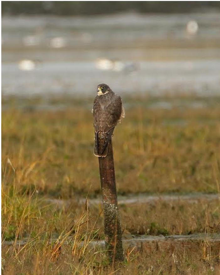
Peregrine

Single birds reported throughout the year but no records for May or June.