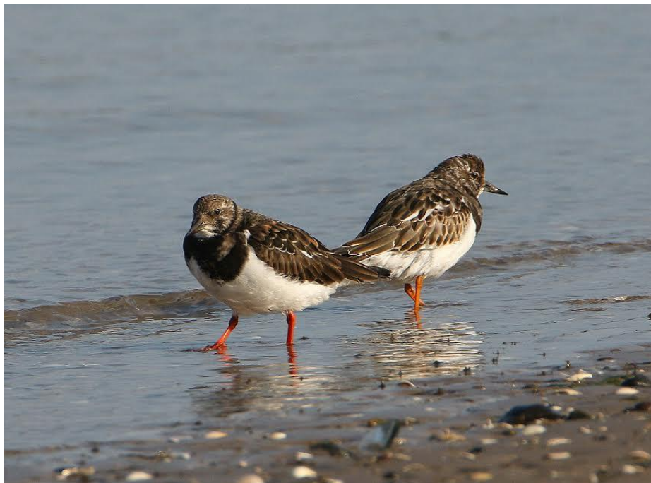
Turnstones

Small numbers occur regularly in June and July.