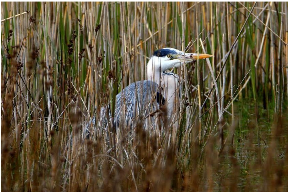
Grey Heron (Mark Collins)

Up to 35 adults and juveniles in late summer and autumn.