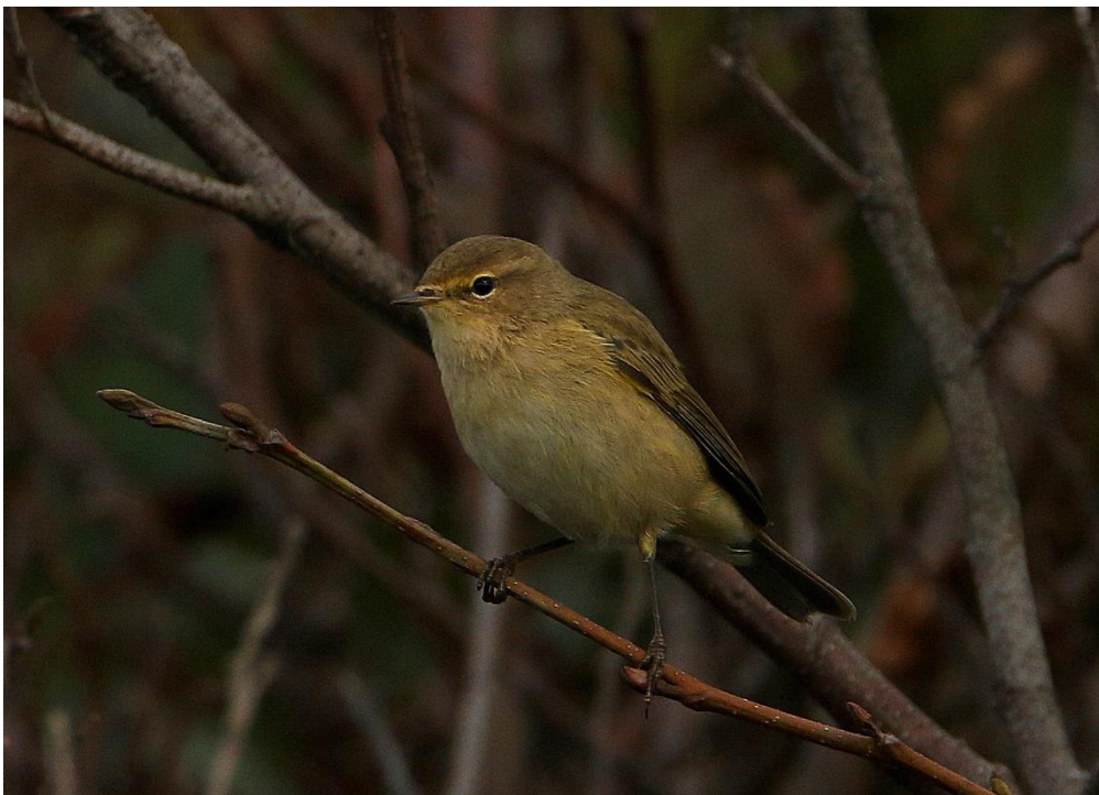
Chiffchaff