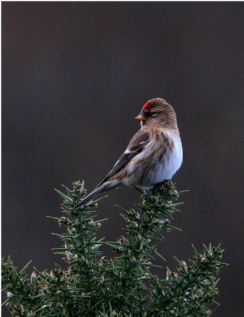
Redpoll