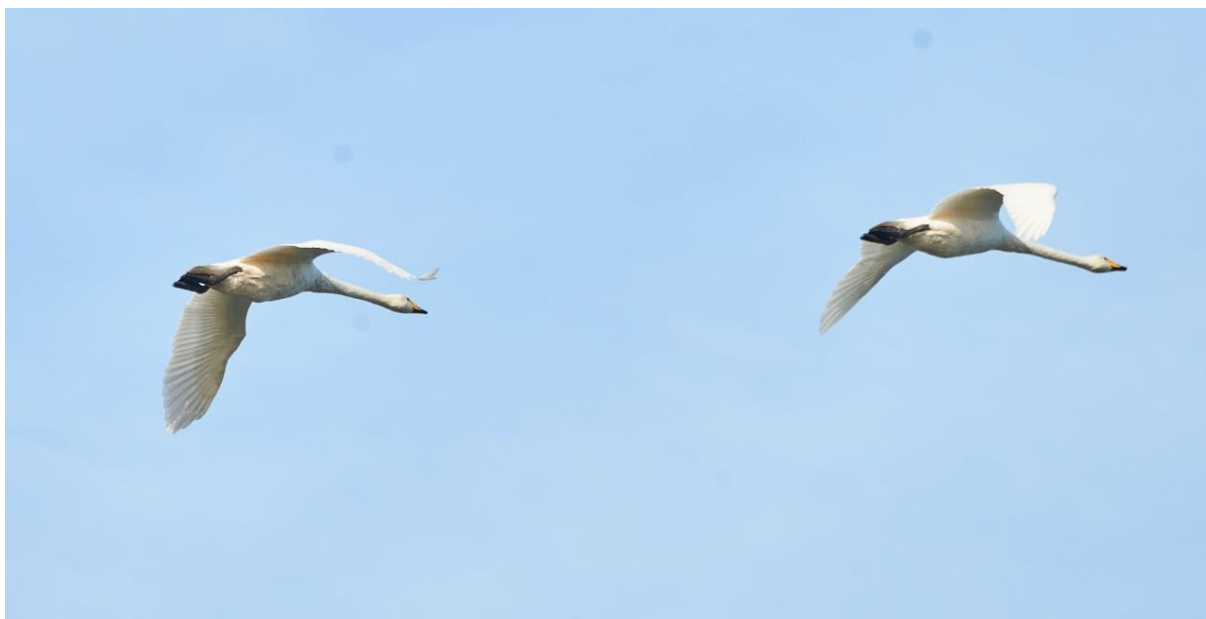
Whooper Swans