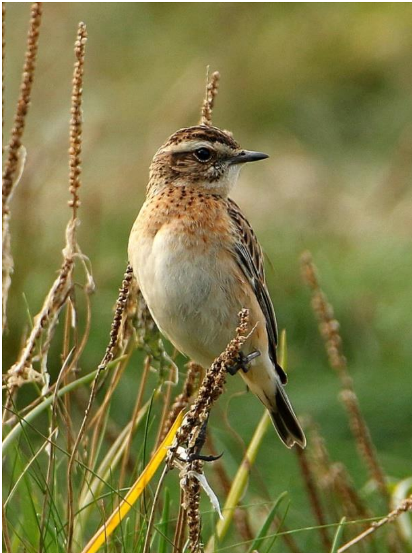
Whinchat