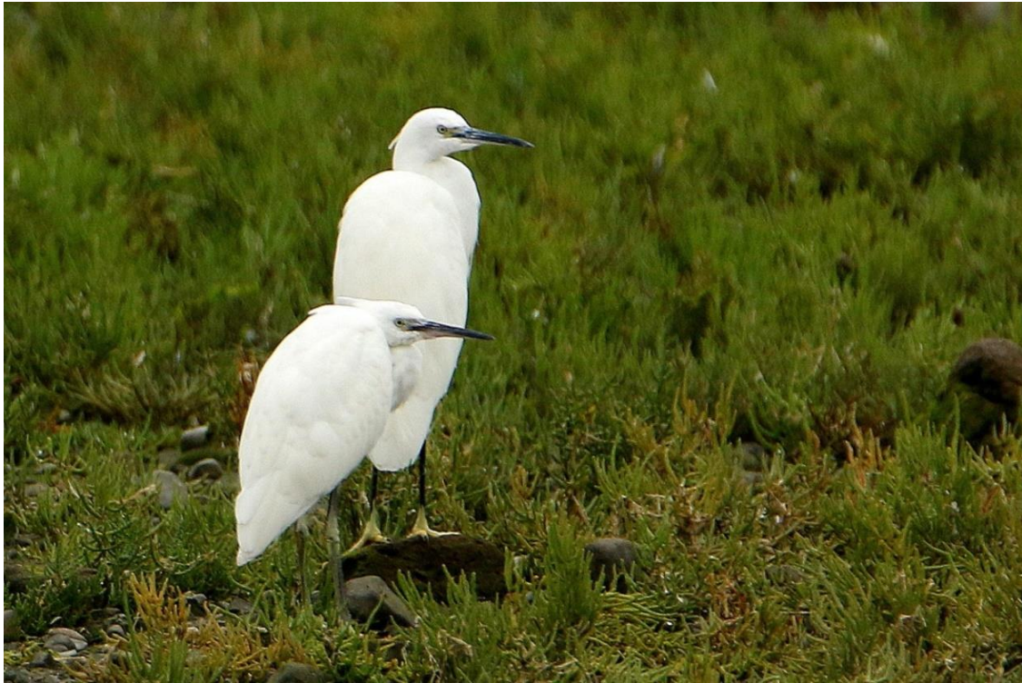
Little Egrets (Mark Collins)

on 13th June (Tom Doyle). The autumn peak count was 89 on 30th August (Tom Cooney). Up to and over 60 occasionally in September and 42 on 5th October.