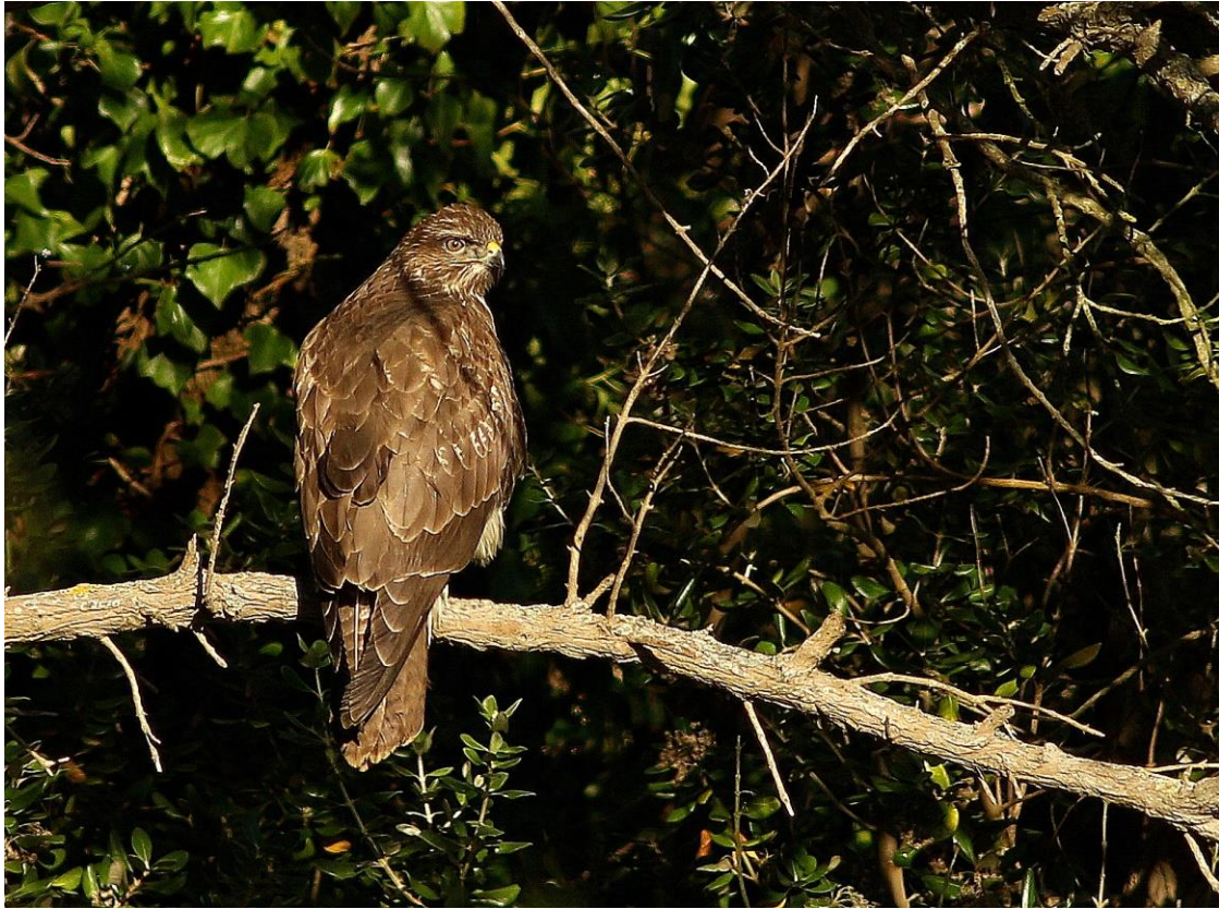
Common Buzzard at River Santry outflow (Mark Collins)