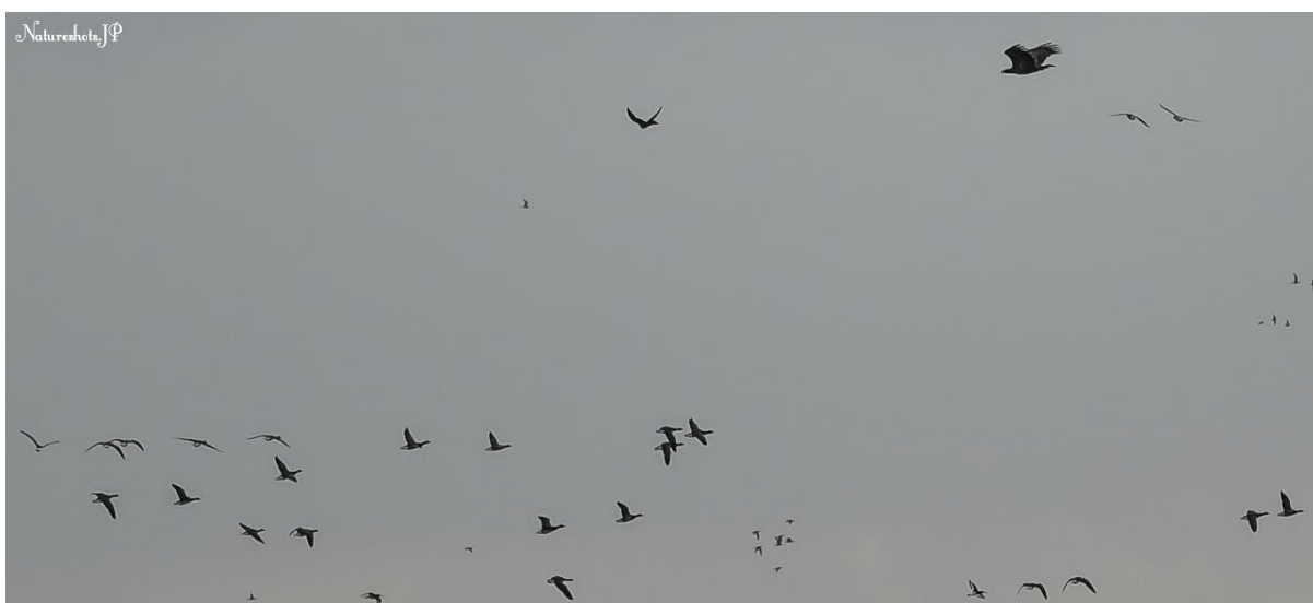
White-tailed Eagle (John Doyle)