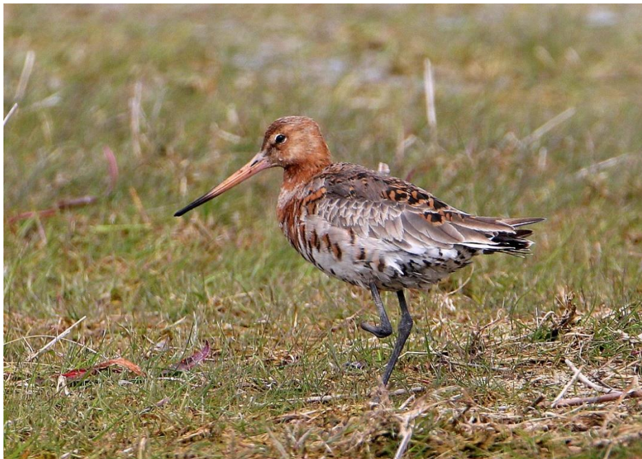
Black-tailed Godwit (Mark Collins)

It is increasingly difficult to determine the cut-off point between late spring passage migration, summering birds and early returning migrants.