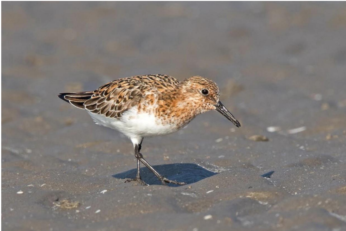
Sanderling