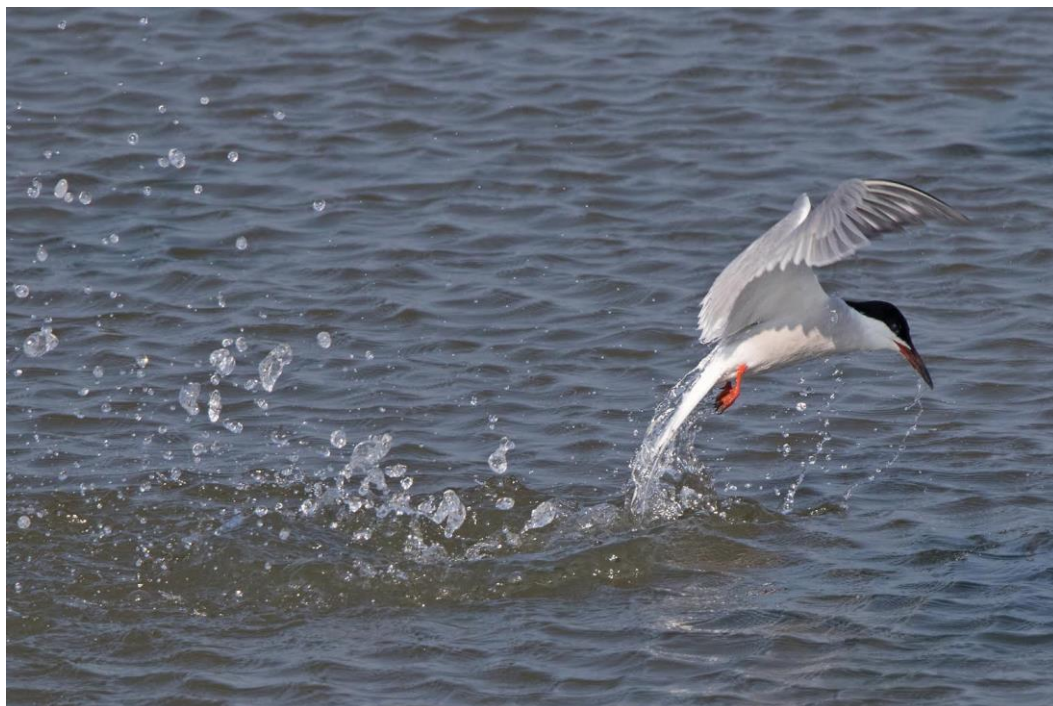
Common Tern