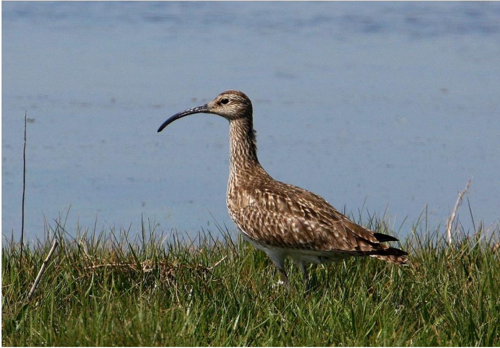
Whimbrel

Common passage migrant and winter visitor