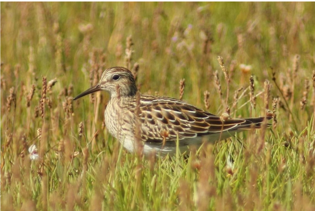
Pectoral Sandpiper