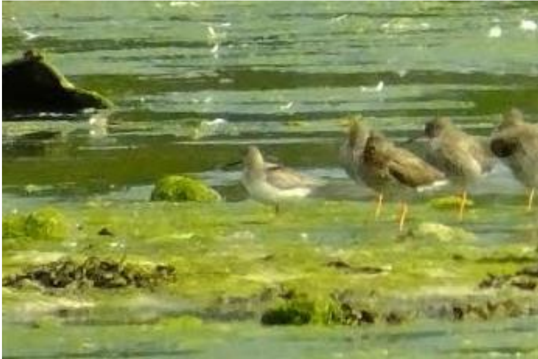
Terek Sandpiper

This is the first island record and the eight Irish record.