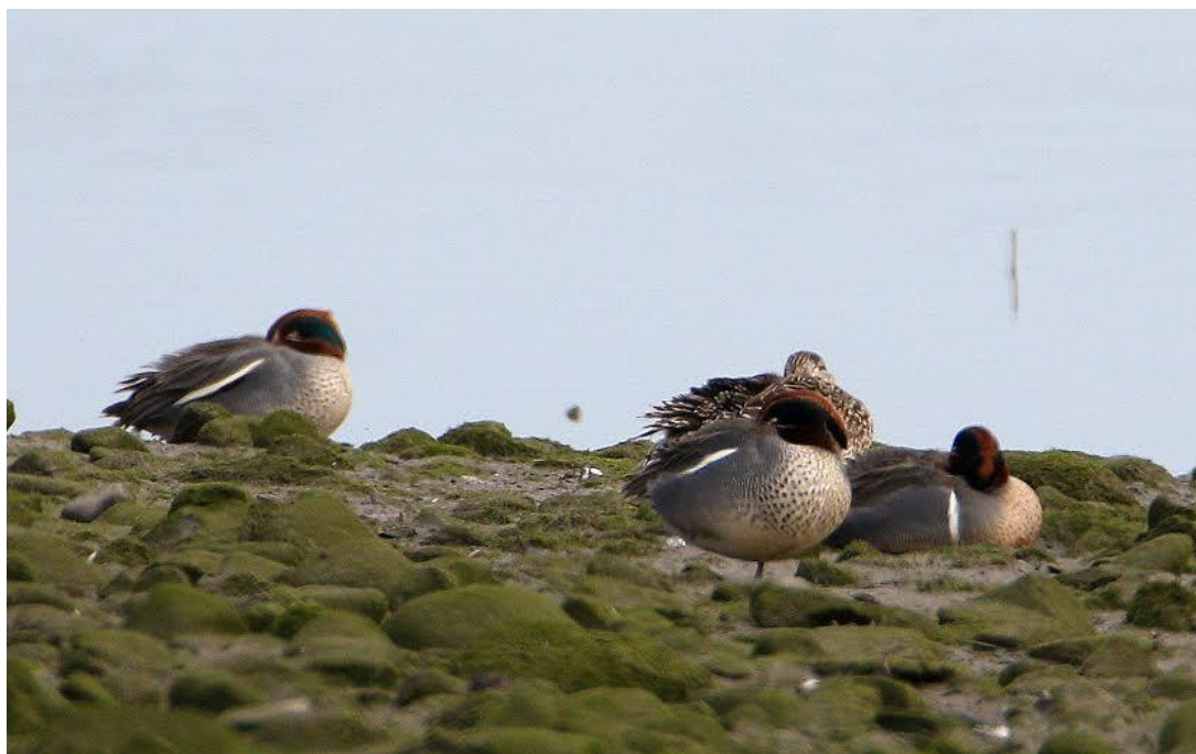
Green-winged Teal (Mark Collins)