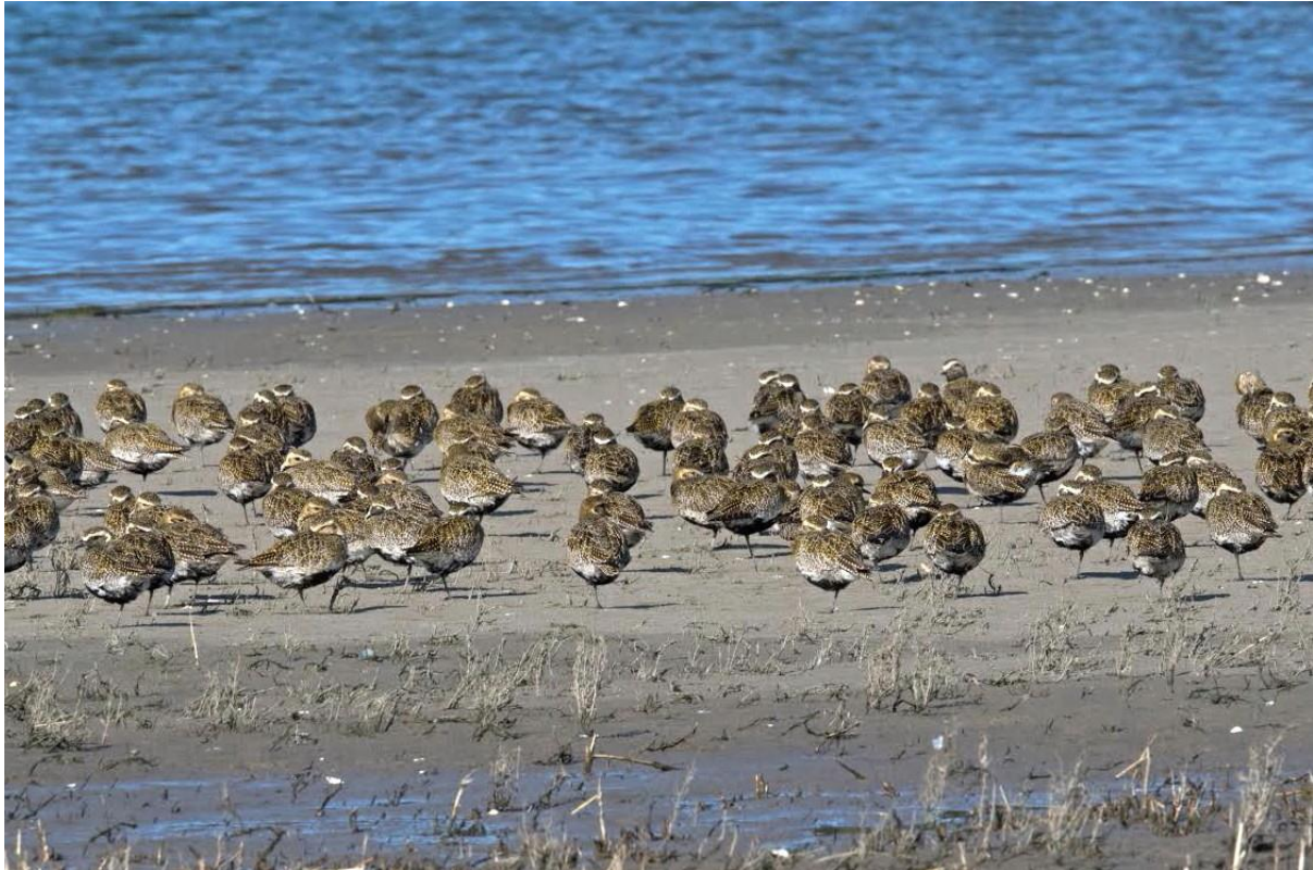
Golden Plovers in breeding plumage, April 2016 (Dave MacPherson)

Common winter visitor and passage migrant