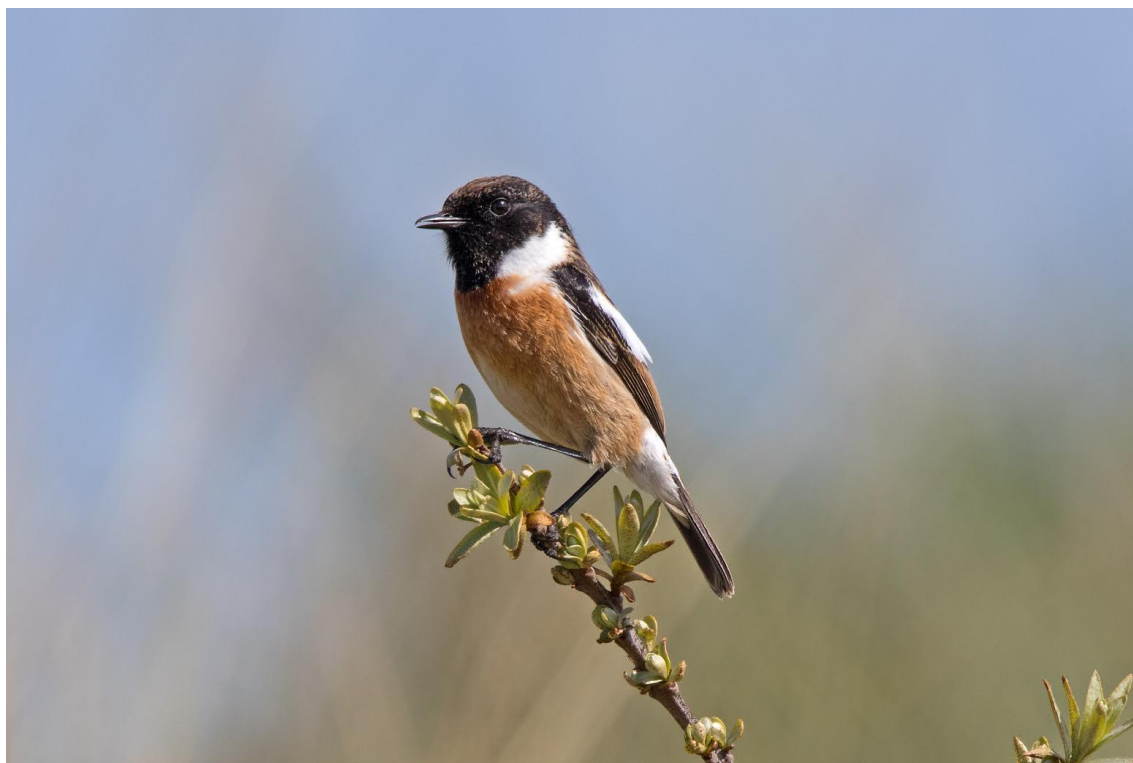
Stonechat

This is the first confirmed nesting for a number of years.