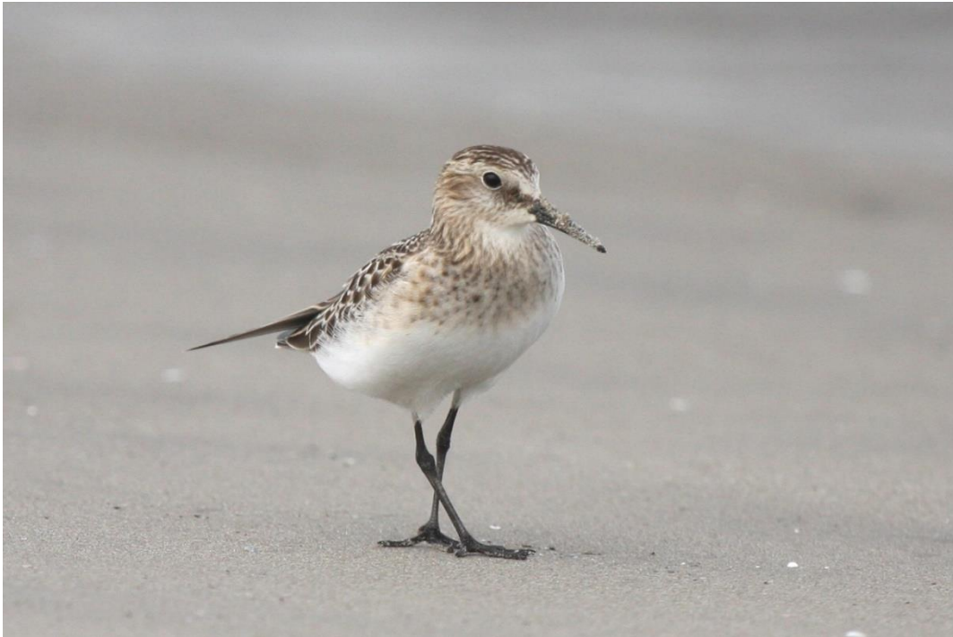
Baird's Sandpiper (Tom Cooney)