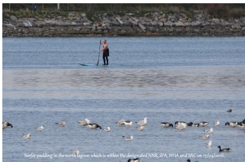
Surfer padding in the north lagoon which is within the designated NNR, SPA, NHA and SAC on 17/04/2016.

Water sports: various activities caused disturbances to birds roosting on the saltmarshes in 2016. On the beach side of the island windsurfing close to the shore regularly disturbed sanderlings and ringed plovers throughout the year. In the lagoons canoeing and boating were common on the highest tides of the year and these activities were observed to cause disturbances to roosting birds for up to one hour at a time. Paddle boarding has become more frequent in recent years causing prolonged disturbances to migratory and wintering birds.