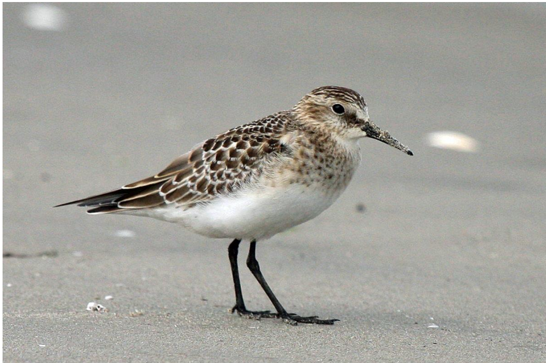
Baird's Sandpiper (Tom Cooney)