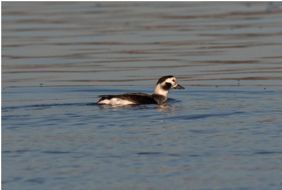
Long-tailed Duck