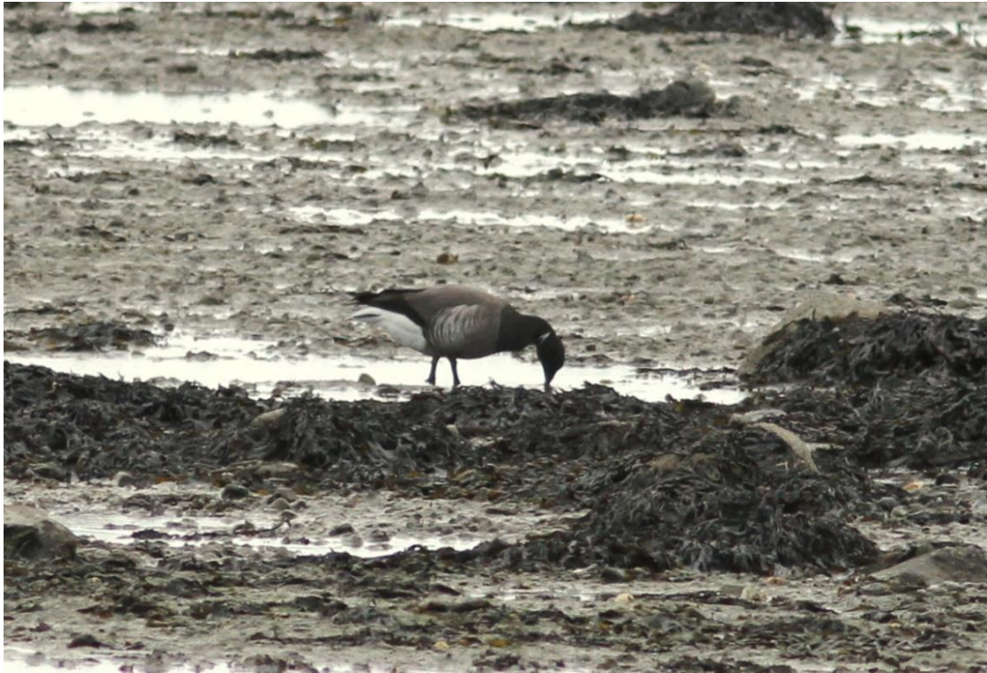
dark-bellied Brent Goose.