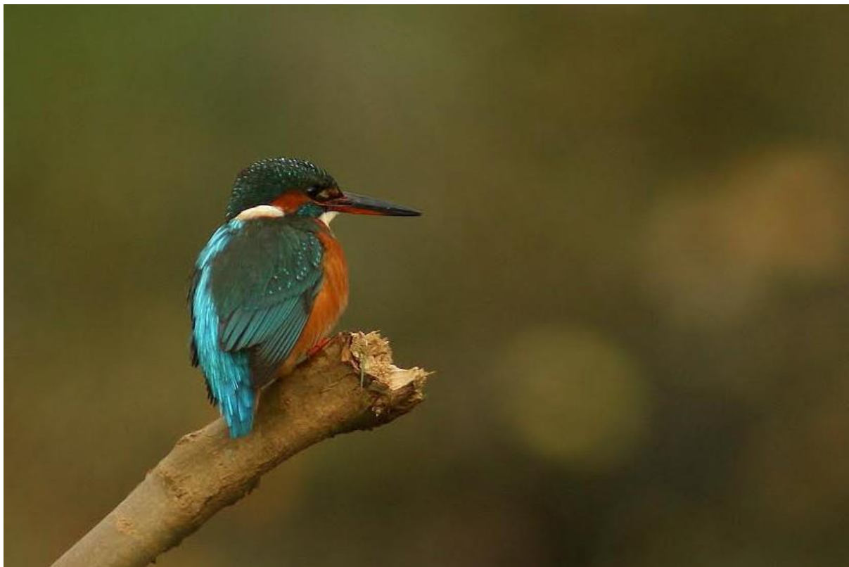
Kingfisher