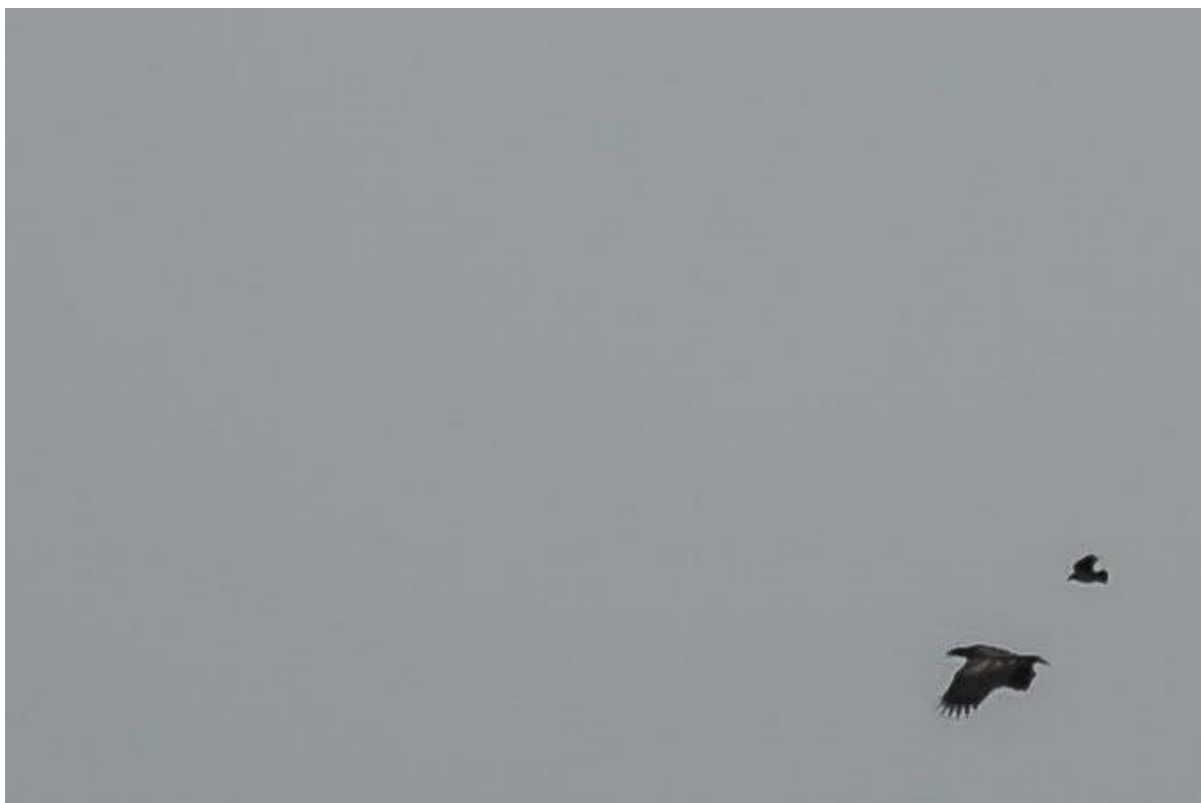
White-tailed Eagle mobbed by hooded crow (John Doyle)