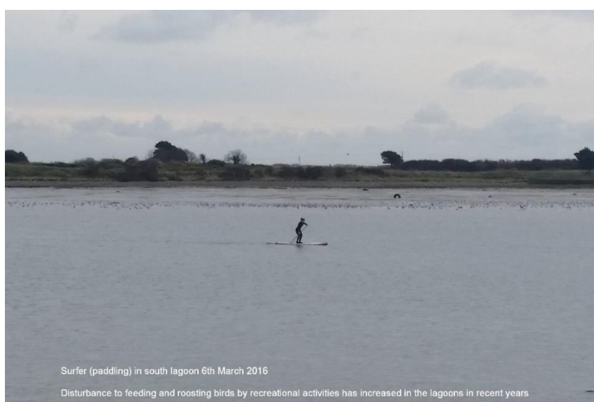
Surfer (padding) in south lagoon 6th March 2016